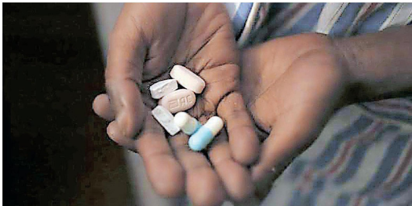
WE NEED to get more young men and more men in their twenties and thirties into health services so that they test for HIV and go on to treatment before they infect girls, the writer says.

Omicron was first described in South Africa in November 2021 –